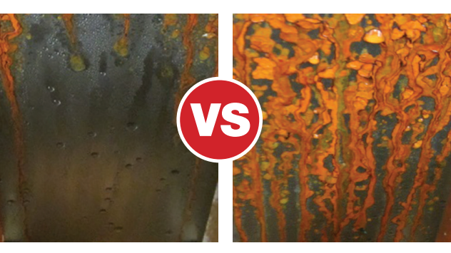
Barracuda Triple Action Lubricant