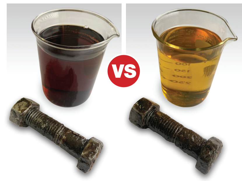
Barracuda Triple Action Lubricant after 8 hours